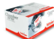
Chamber Brite Autoclave Cleaner