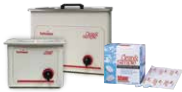
Clean&Simple™ Ultrasonic Cleaners and Tablets

For over 90 years, Tuttbauer's sterilization and infection control products have been trusted by hospitals, universities, research institutes, clinics and laboratories throughout the world. Supplying a range of top-quality products to over 100 countries. Tuttbauer has earned global recognition as a leader in sterilization and infection control.