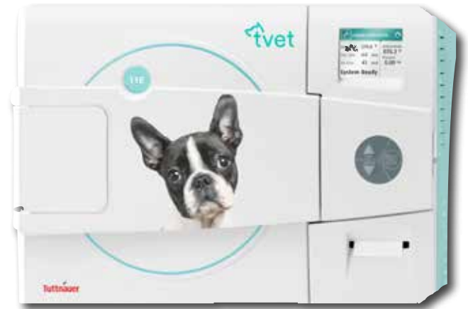
Includes USB flash drive and one instrument pouch rack with machine