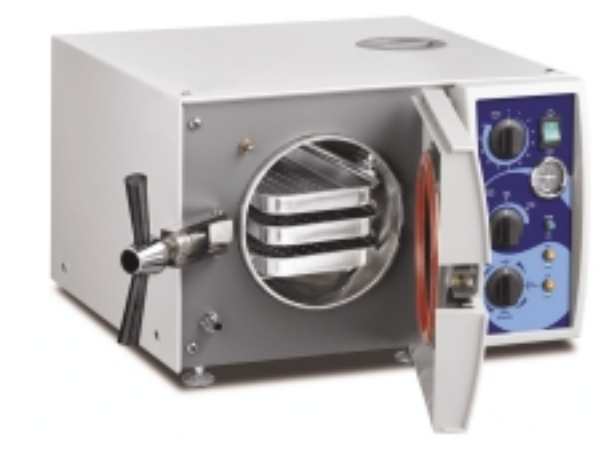
\ensuremath{^{*}\text{Come}} up time, sterilization exposure and exhaust.